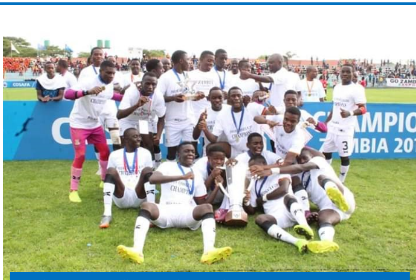
Zambia u20 Football Team celebrate their COSAFA 2019 Championship triumph at Nkoloma Stadium in Lusaka.

The win takes Zambia's tally to a record 12 COSAFA U-20 titles with South Africa remaining second with their tally of eight titles.