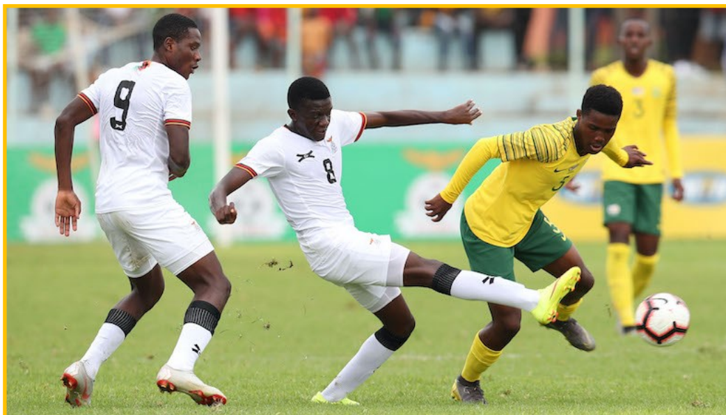
Zambian footballers (White) in action against South Africa (Gold and Green)