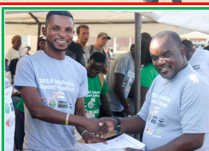
A selection of pictures from the festival.