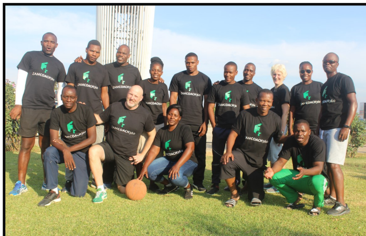
Coach Developers pose for a group picture during the training.

NOCZ with support from Olympic Solidarity collaborated with the International Council for Coaching Excellence (ICCE) and the Norwegian Olympic and Paralympic Committee and Confederation of Sport (NIF) to run Part II of the Coach Developer training from 11 November to 15 November 2019 at Sandy's Conference Centre.