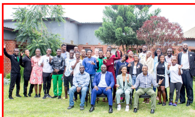
Zambia AC Forum 2019