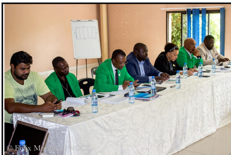
NOCZ Executive Board during AGM at OYDC Zambia Sports Development Centre

NOCZ hosted the 2019 Annual General Meeting on 7 December 2019 at OYDC Zambia - Sports Development Centre in Lusaka.