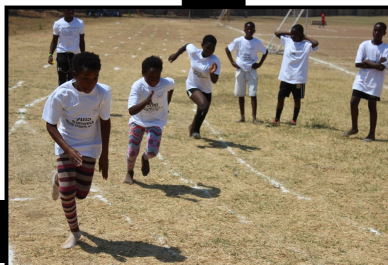
Participants in action during the festival