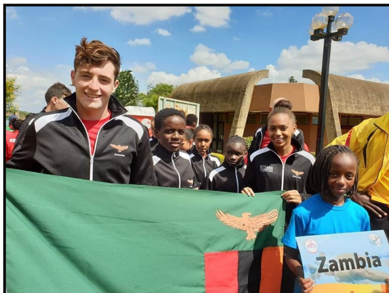
Zambia Swim Team during the opening ceremony of the CANA ZONE III Swimming Championships in Kenya