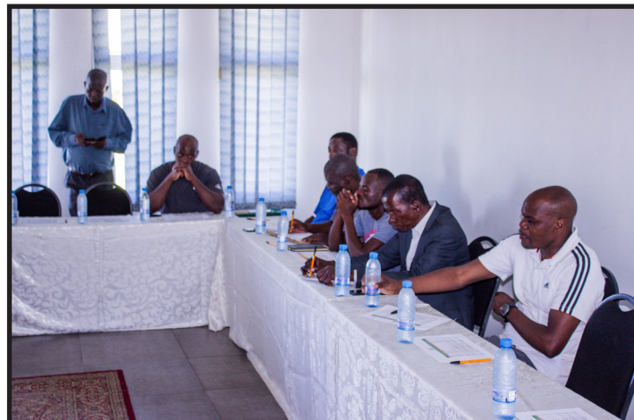
Some of the participants from ZBF during the Strategic Planning Workshop