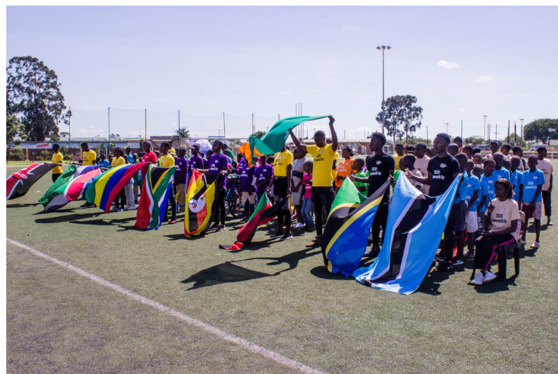
2020 Commonwealth Day Commemoration participants display various flags of Commonwealth Member Countries.