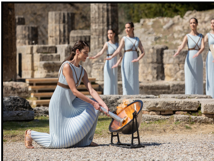
Lighting of the Olympic Flame in Greece