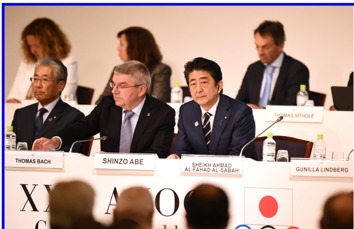
Japan's Prime Minister Shinzo Abe (Right) and IOC President Thomas Bach (Centre)

Japan's Prime Minister Shinzo Abe and International Olympic Committee (IOC) President Thomas Bach agreed on Tuesday 24 March 2020 to postpone the Tokyo 2020 Olympic Games until 2021.